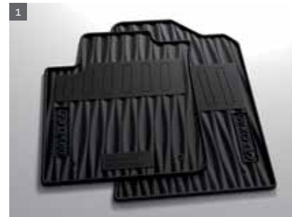
1 ALL SEASON FLOORMATS

▼ INTERIOR Custom-made of durable and wear-resistant material – they are designed to protect the interior footwell and capture dirt, sand, and other debris while staying securely in place.