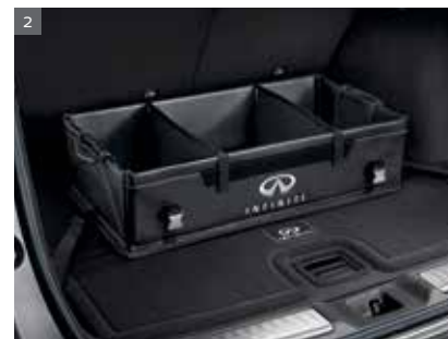
2 TRUNK ORGANIZER

▼ CARGO Customize the space with removable dividers that can be secured with straps in the cargo area.